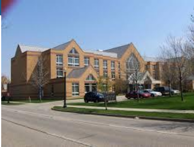
Haworth Inn and Conference Center 255 College Ave Holland, MI 49423

The Haworth Inn & Conference Center offers a professional meeting space, with comfortable rooms and enjoyable food.